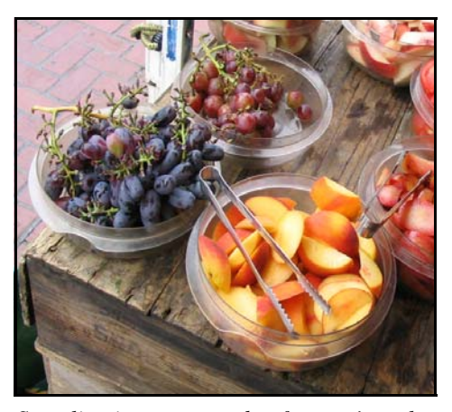
Sampling is encouraged at farmers' markets.

Although most of the markets in San Francisco are successful, several markets have failed in recent years. The Ferry Plaza closed its Sunday and Thursday night markets, due to lack of interest. Markets at the Cannery and Mission Village also closed as did a Chinatown Night Market. For the past few years, the Marina district has been struggling to support a market. The California Farmers' Market Association ran a market on Steiner Street, but due to logistics moved it to the Marina Middle School on Fillmore Street. This year here have been two separate unsuccessful attempts to operate a market in the Marina.