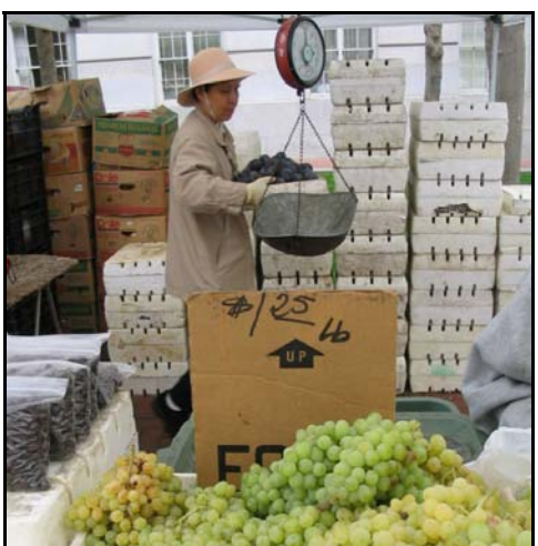
Green grapes and other fresh fruit are sold at the Heart of the City Farmers' Market.

The Fillmore Farmers' Market has about 1000 customers, 20 stalls, and 25 more vendors on a wait list, but cannot grow due to the physical limitations of its space. It serves the immediate community of Western Addition, Pacific Heights and Japantown, and depends on a loyal, local customer base. Problems include parking, and initial difficulties securing a street closure permit. It is managed by the Pacific Coast Farmers' Market Association (PCFMA), and the neighboring Fillmore Center aids the market by allowing the market to use the Center's plaza space.