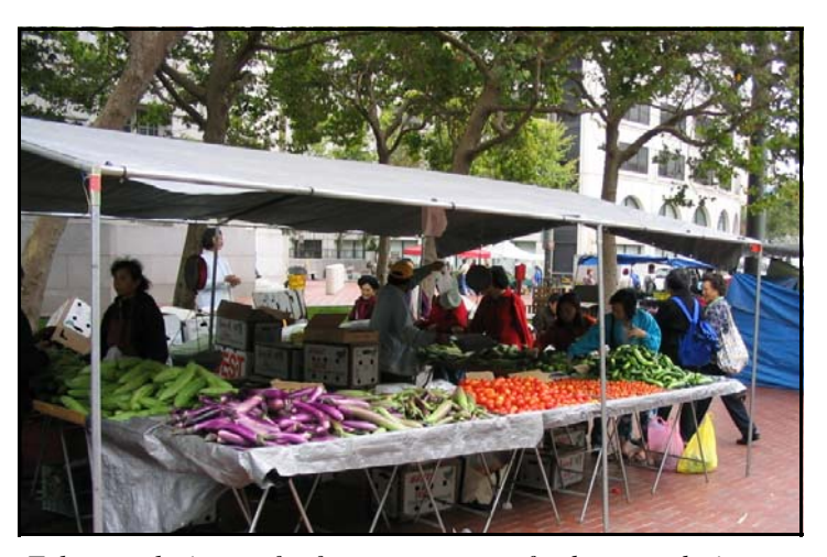
Tokens make it easy for farmers to accept food stamps during a busy market day without any significant hassles or wasted time.

many has already accepted more EBT in the first half of 2007 than in all of 2006. Anecdotal data from Fillmore and Kaiser Markets also suggest increases in food assistance program use.