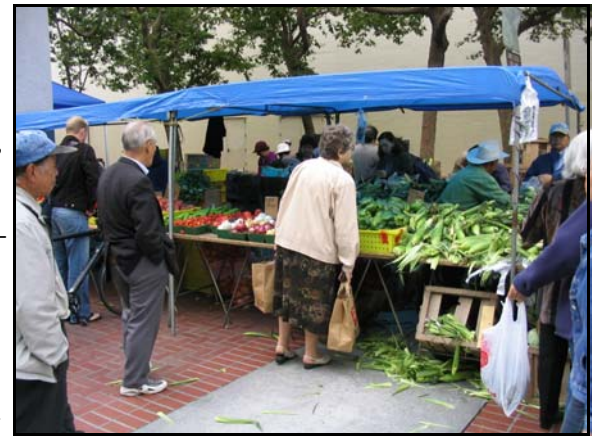
Heart of the City is a successful low-income market.

Perception – There remains a perception that farmers' markets are expensive and upscale, despite direct comparisons of markets and their neighboring grocery stores show that markets are cheaper than conventional grocery stores (Gaudette, 2007) (Southland 2001).