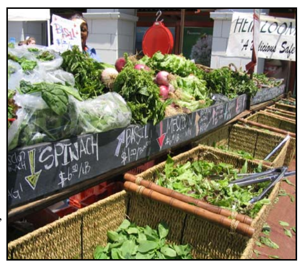
Fresh greens from the Ferry Plaza Farmers' Market.

On Tuesdays, the Ferry Plaza Farmers' Market has about 5000 customers and 30 stalls, and on Saturdays it has up to 25,000 customers and 75 stalls. Although there is room and a long waiting list, the market is not currently taking on new vendors because it wishes to avoid excess competition amongst its farmers. The Ferry Plaza Farmers' Market serves the entire community of San Francisco and many tourists. It succeeds because it is well established and has exceptionally high quality food. Problems for this market include a lack of parking for both customers and farmers' trucks, and a lack of coordination with the city regarding parking and other issues. It is operated by the Center for Urban Education about Sustainable Agriculture (CUESA).