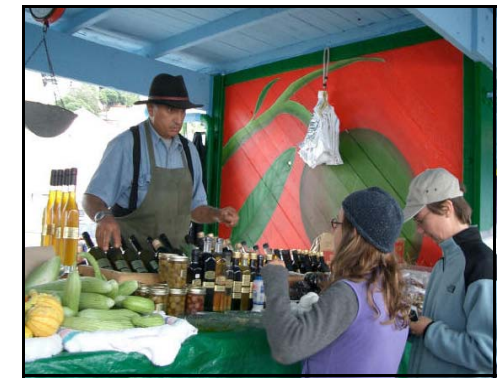
the city-run Alemany Farmers' Market.

lack of funds for the upkeep of the aging facility, which needs renovation. The market is operated by the San Francisco Real Estate Department.