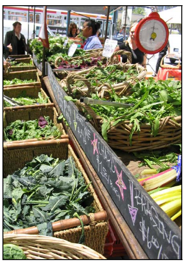
Fresh produce at San Francisco's farmers' markets entices shoppers on many days each week, including at the Ferry Plaza Farmers' Market (above) and at the Heart of the City Farmers' Market (below).

The managers were surveyed to determine their opinions of the minimum resources necessary to support a market and necessary attributes of suitable locations. Programs in other major cities were examined, as were studies on low-income markets throughout the nation. Each of the Board of Supervisors' offices were contacted to learn the current demand for farmers' markets in the various neighborhoods throughout the city.