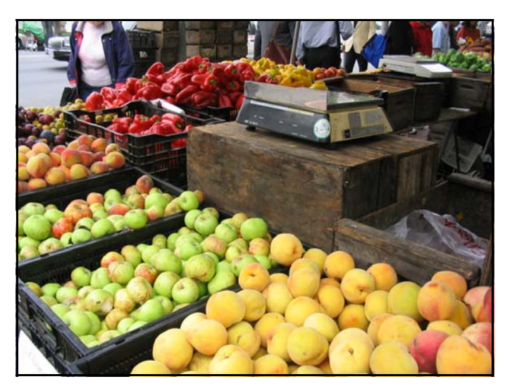
Seasonal peppers plums, stone fruit, apples and more.

New York City's Health Department has a "Health Buck" program to increase local fresh fruit and vegetable consumption and support farmers' markets. Public Health offices and community organizations distribute Health Bucks, each valued at $2, to low income communities. Health Bucks can only be redeemed at farmers' markets. In 2006, over 9,000 Bucks were distributed, of which 40% were redeemed, and in 2007 over 15,000 health bucks are being distributed. Incentives to increase food stamp usage are also included in the program, as anyone spending $5 in food stamps at a farmers' market receives a $2 coupon. Currently, 30 markets participate in the program, half of which accept EBT/ food stamps.